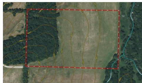
TRACT G N FARM ROAD 61 (24 AC +/-)